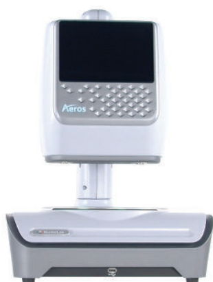
Aeros® Reflectance Spectrophotometer